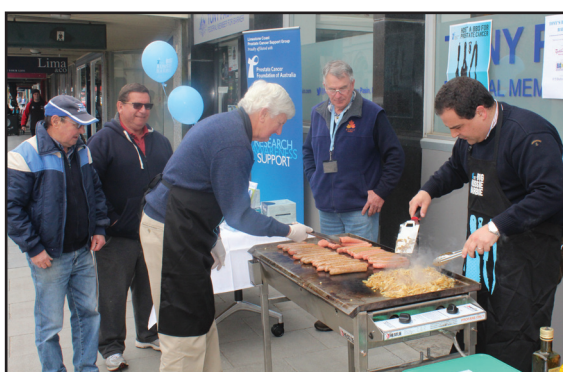
ABOVE: MP Tony Pasin's barbecue to support prostate cancer awareness.

Yet again during September, MP Tony Pasin held a barbecue in front of his Mount Gambier office, and featured an information stand with eight support