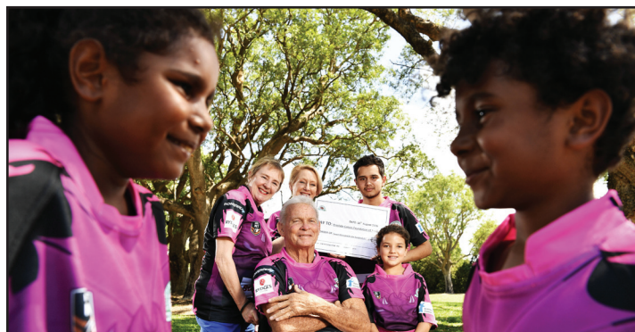
ABOVE: The Nightcliff Dragons Rugby League Club presented PCFA with a $7000 cheque.